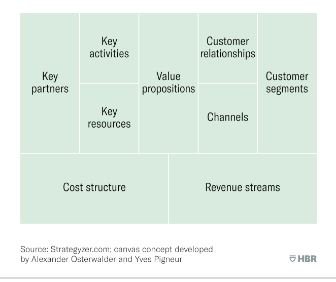
See more HBR charts in Data & Visuals on HBR.org.

Nine key elements comprise the basic building blocks of a business; their positions on the canvas illuminate how they affect one another.